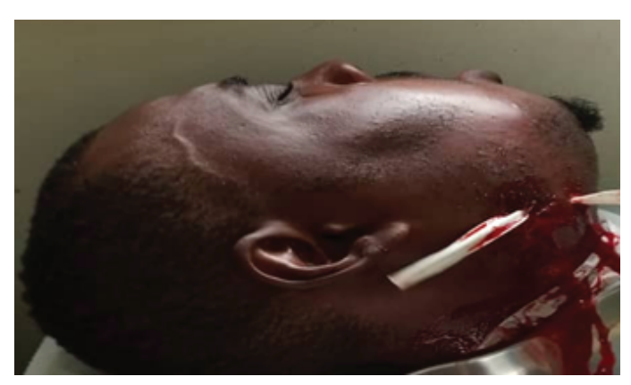
Figure 3. Drainage of cellulitis (Image CMF Stomatology Department, CHUO).