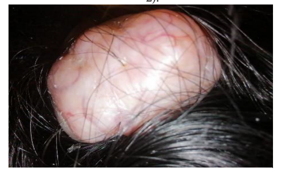
Figure 1. Patient at the time of present

The mass was freely mobile, non-compressible and non-pulsatile (Figures 1 & 2).